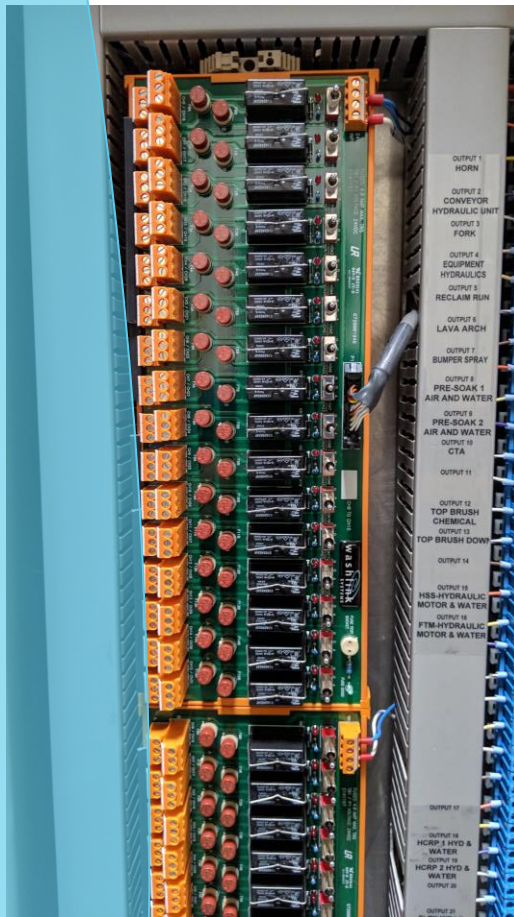
New output boards