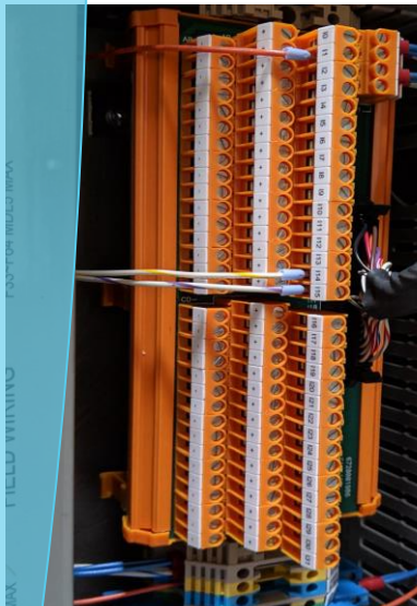
New input board